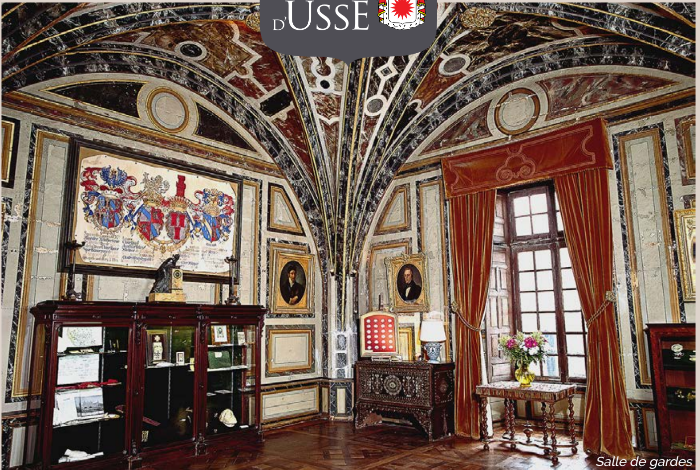
Salle de gardes